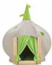
Grow.upp Cave Partition