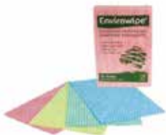
Compostable Cleaning Cloth