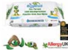
My Happy Planet 100% Biodegradable Baby Wipes