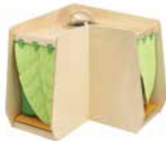
Corner Cabinet with Curtain and Viewing Bubble