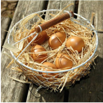
Play Eggs 6 pk