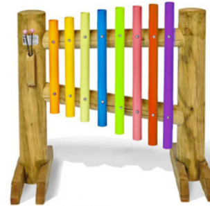
Outdoor Chimes – Multi-coloured x8

SKU: MOE/MH/DR053 DIMS: 120 x 45 x 90 cm