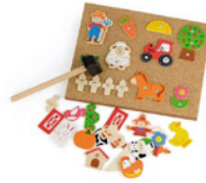
Hammer & Tack