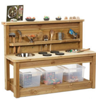
Large Mud Kitchen