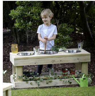
Potion Bench (3 station)