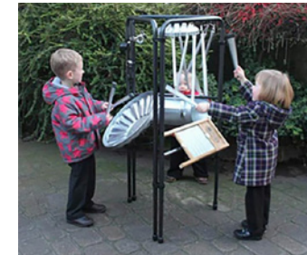
Urban Noise Maker

SKU: MOE/TMT/018 DIMS: 150 x 100 x 150 cm