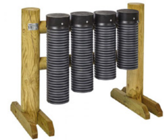
4 Drum Panel Set