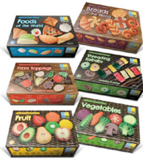
Mud Kitchen Food Stones Collection