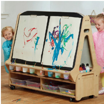
Double-sided 4 Station Chalk/Whiteboard Easel with Low Storage Trolley

SKU: MOE/MH/DR037 DIMS: 100 x 60 x 100 cm