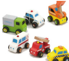
Wooden Car Set