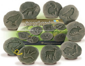
Let's Investigate Woodland Footprints 8 pk