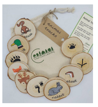
Wooden Animal Tracks Pack

Have specific measurements? Speak to our team and see how we can help!