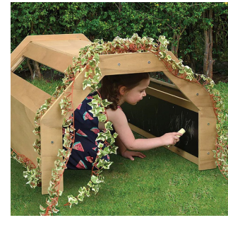
Outdoor Wooden Discovery Tunnel