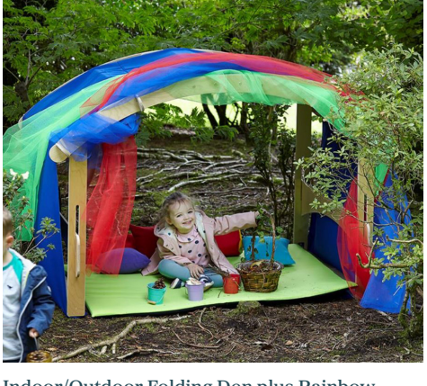
Indoor/Outdoor Folding Den plus Rainbow Den Kit

Create a sensory experience with the Indoor/Outdoor Den plus Rainbow Den Kit. With its unique folding mechanism, the den is simple to assemble and easy to move.